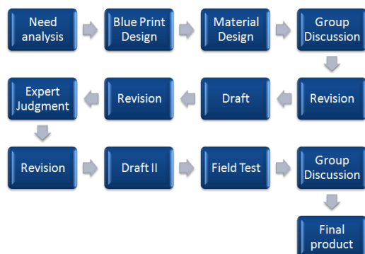
Figure 2. The new developed design

The research model above was simplified in order to make it easier to understand and developed into a new design shown in Figure 2 below.